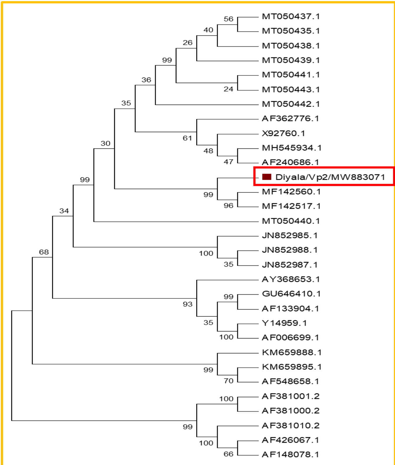
Figure 3. Phylogenetic relationships determined by the VP2 gene sequence of the local IBDV isolates and the corresponding sequence of infectious bursal disease virus from GenBank. The phylogenetic trees were generated using the treetop phylogenetic tree prediction program (GeneBee-Molecular Biology Server MGA-6). Diyala isolate was located in one cluster with other isolates (MF142560.1) and (MF142517.1) from the USA.